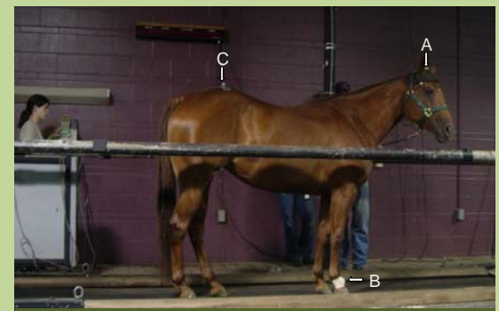
A: Sensor placed on poll to measure vertical head acceleration 3: Sensor placed on cranial side of pastern used as stride marker C: Sensor placed between the tubera sacrale measuring vertical pelvic acceleration