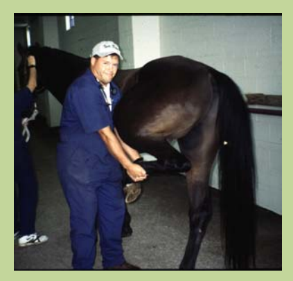
Figure 1: Student performing a rightsided hock flexion test

This experiment used 10 horses from the University of Missouri's teaching herd. These horses were brought into the University of Missouri's equine veterinary teaching clinic, and underwent a veterinary evaluation. We then used the wireless motion analysis system to evaluate lameness and measure the response before and after performing the hock flexion test on a hind limb. This system consists of three sensors, as seen in Figure 2. The first is an accelerometer placed on the poll to measure vertical head acceleration, the second is a gyroscope placed on the cranial side of the right pastern to measure angular velocity and to be used as a stride position marker, and the third is an accelerometer placed between the tubera sacrale to measure vertical pelvic acceleration. We used this system to measure the maximum and minimum differences of the pelvic height as the horse trotted in a straight line. A sound horse should ideally have a difference of zero, with the maximum and minimum heights of the pelvis during the stance phases of the right and left hind limb strides being equal. We calculated these differences for each stride for five strides, and also calculated the mean of the differences. Because we evaluated each horse before and after both a right and a left hock flexion test, each horse serves as its own control.