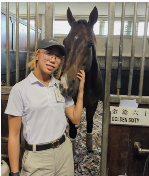
Iris with Golden Sixty, aka the most expensive horse in HK with earnings of HK$165,850,600